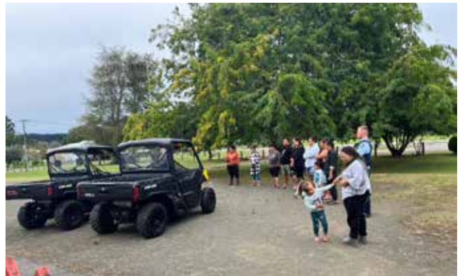
4-wheel quad bikes were provided to enable access and delivery of goods to people when they are cut-off, when roads become hazardous and inaccessible by car/truck.

Funding supported the development of a Community Resilience plan for the Mangatū-Whātātūtū-Pūha area. The community was significantly impacted by Cyclone Gabrielle, facing flooding, isolation, limited resources, and a lack of access to medical support and broader assistance. Recognising the challenges of their remote location and inadequate infrastructure, Mangatū Marae took steps to ensure preparedness for future emergencies. The funding enabled them to equip evacuation sites, and establish a dedicated emergency response team comprising local registered nurses and healthcare professionals. As a result they now have plans in place and resources to meet the basic needs of 400-500 people for at least a week, without external aid.