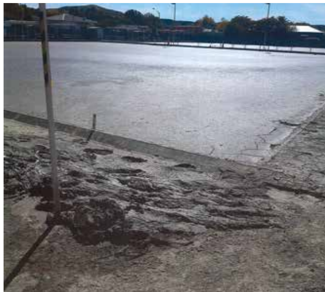
From this . . .