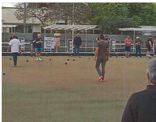
. . . to Wednesday twilight bowls, engaging 60 people each week.